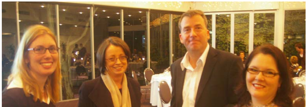
Shelter's 30th Birthday—Board Members Celebrating