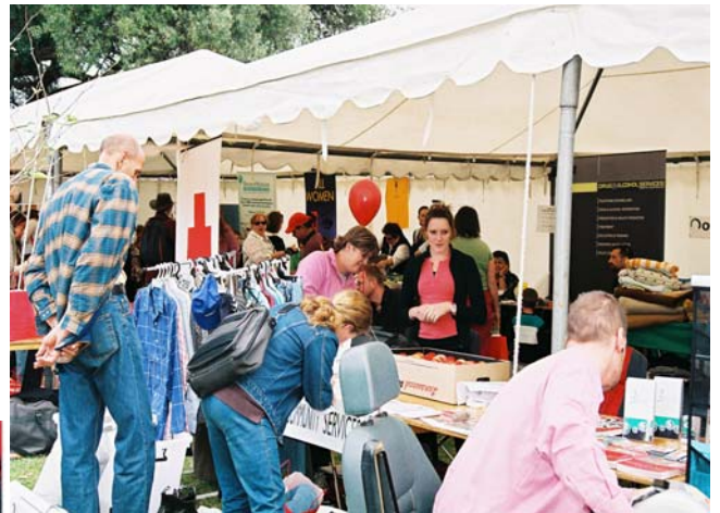
HHH Expo 2006