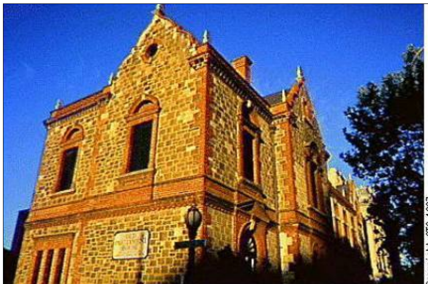
Old Parliament House, North Terrace Adelaide

Please note that for security reasons, you need to RSVP to the Shelter office on 8223 4077 or email cheryl.shepley@sheltersa.asn.au by Friday 16 October so Parliamentary Passes can be prepared. Parliament House has a security screening system much like the airports, which takes a little bit of time, so please plan on arriving between 1.00 and 1.20pm to ensure a 1.30 pm start.