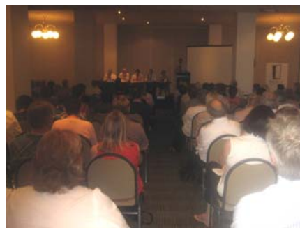
View from the Audience