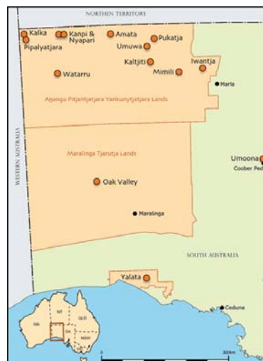
Map of the APY Lands

And finally, I wonder what the cost of living like a white person is to my Anangu friend. I worry that she is lonely, homesick and longs for the comfort and strength of her family.