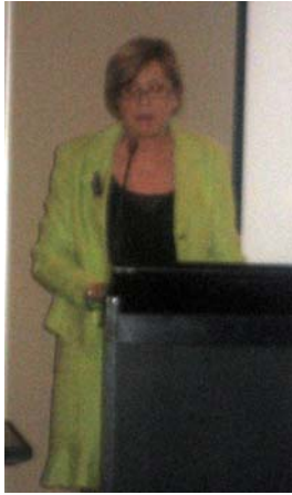
Hon Jennifer Rankine, Minister for Housing