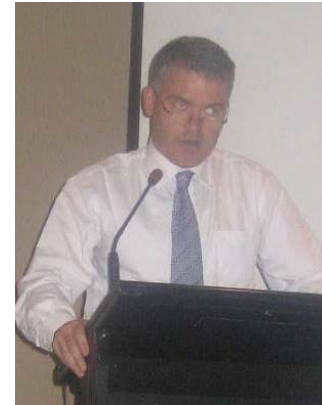
Hon Stephen Wade, Shadow Minister for Housing