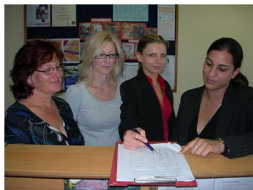
Staff and Volunteers of the Housing Legal Clinic