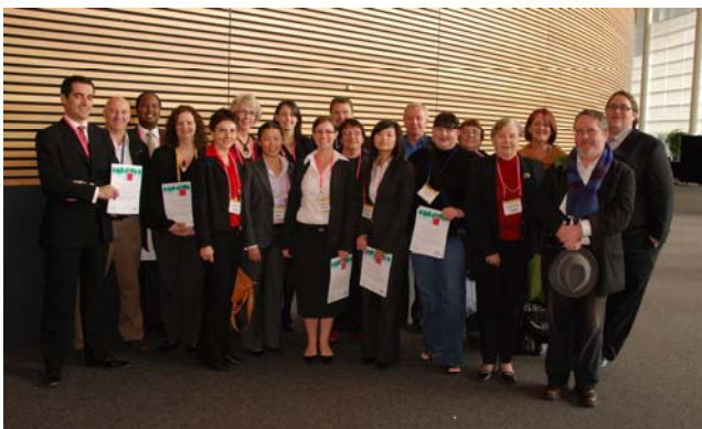
Representatives from the Housing Legal Clinic's host organisations

(The Housing Legal Clinic is supported by the SA Department of Housing, Law Foundation SA, Morialta Trust and Community Benefit SA)